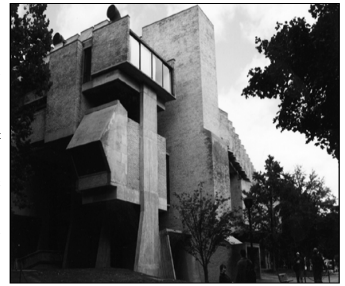
Modern mystery of architecture and inefficiency: the Goddard Library.

The Goddard Library. Once you get past the shock that this thing was ever built (some people who still haven't gotten over that shock insist that the library is an alien space ship), you realize what a pain in the ass this building really is. Who has ever heard of a building where there is no ground floor, and the second floor is really the lobby? What about all of those creepy narrow staircas-