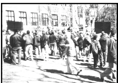
Spree Day was better (and cheaper) than expected.