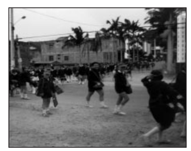
BEST PHOTO EVOKING THE MEMORY OF A BEAT POET Anonymous "Jack Kerouac's Wet Dream"