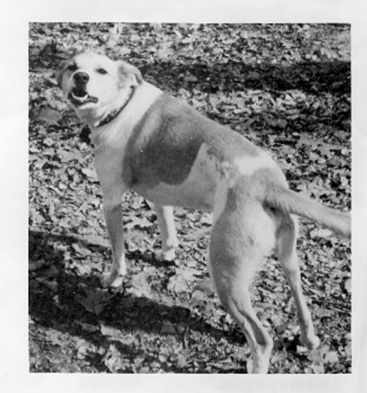
"Don't forget to vote!"